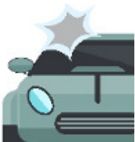
Road Traffic Collisions