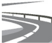
Highways & Road Faults